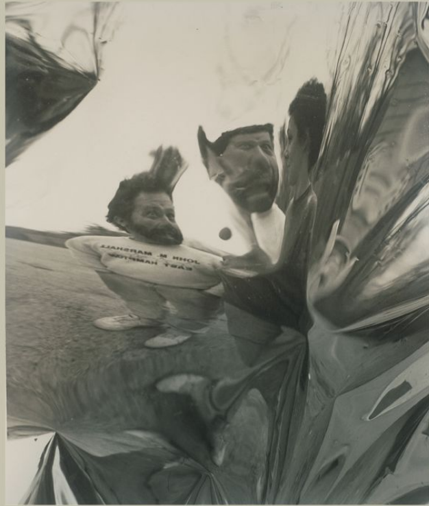
This was like a new paint brush for me, so I added some humor.