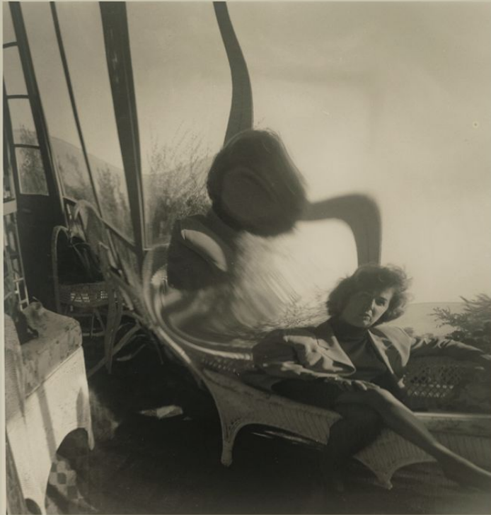
Then, I found a piece of reflective mylar and I found that it was a way for me to take that photograph.