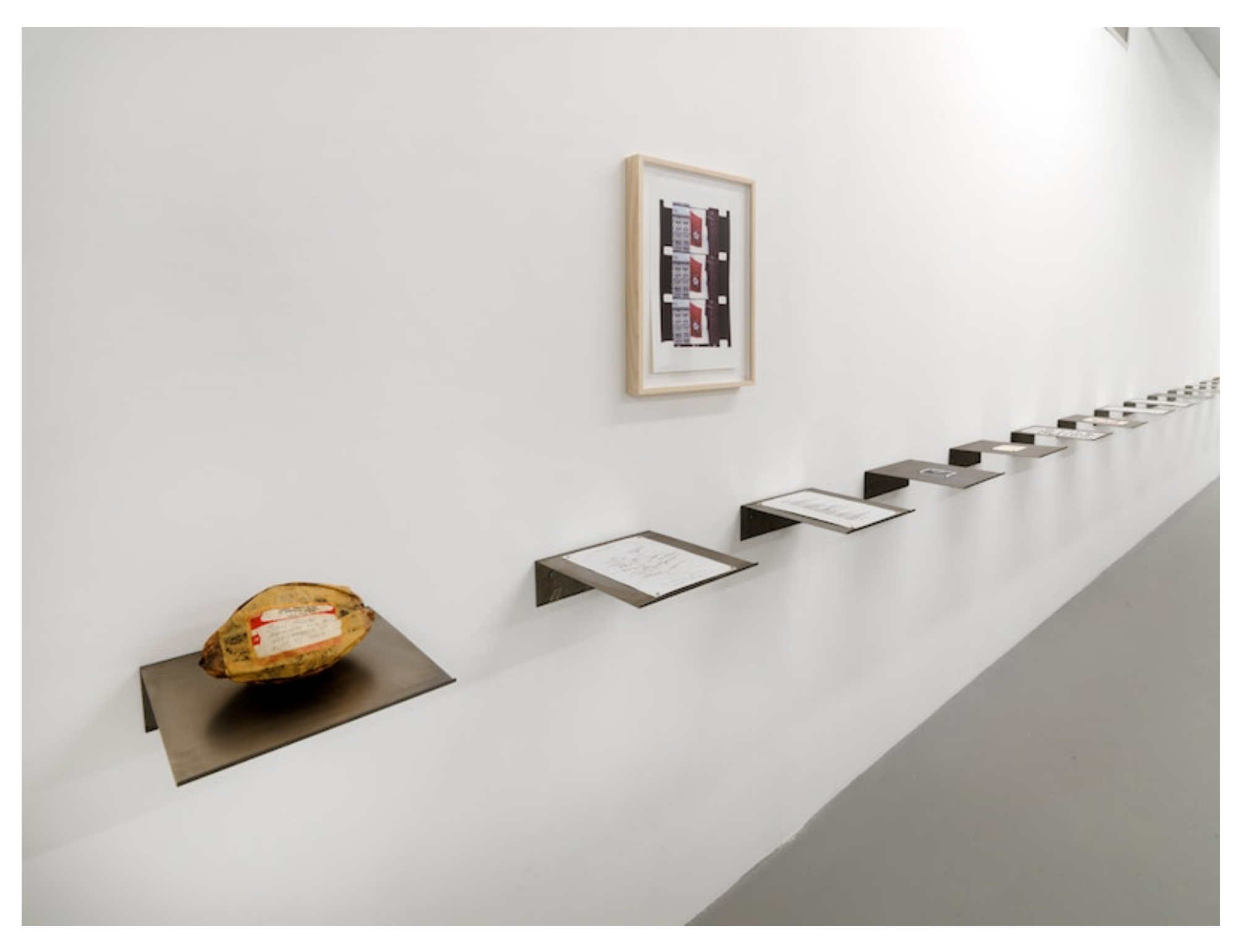
Installation view: Jonas Mekas, Open Archives , Mana Contemporary Chicago, 2023.

The ephemera featured includes scrawled poetry and doodled flowers, a box of raw amber, photographs of family, Mekas's Chelsea Hotel key tag, a coconut addressed to Anthology Film Archives (no one seems to know the story), a hand drawn map of lower Manhattan (everything below City Hall and Yoko Ono's apartment labeled as "nothingness"), his Teamsters Union membership card, and various pieces of paper scribbled over with phone numbers, confessions, notes to self. In a corner, one note reads "I do not live horizontally: I live vertically!" and the full calendars on display and a daily schedule—broken down into half hour blocks—prove it.