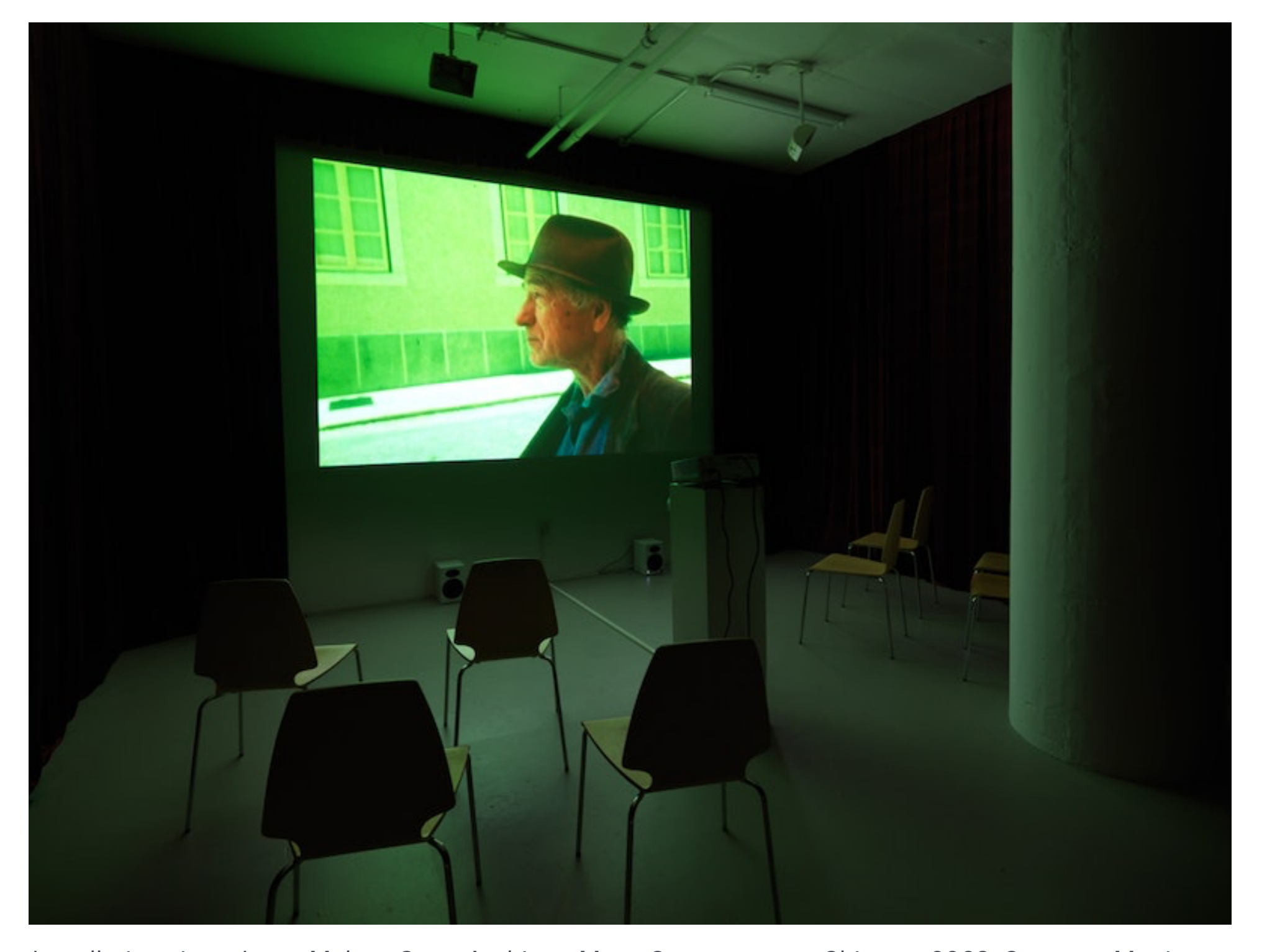
Installation view: Jonas Mekas, Open Archives , Mana Contemporary Chicago, 2023.

Mekas's film Out-Takes from the Life of a Happy Man plays in the gallery's adjoining room, which has been converted into a screening space lined with red velvet curtains. The film was chosen in part because it shows many of the objects included in the exhibit, such as the hot splicer he edited his films with, which appears in the opening and closing shots of Out-Takes as Mekas, his hands moving slowly, carefully wraps the film strips around the apparatus.